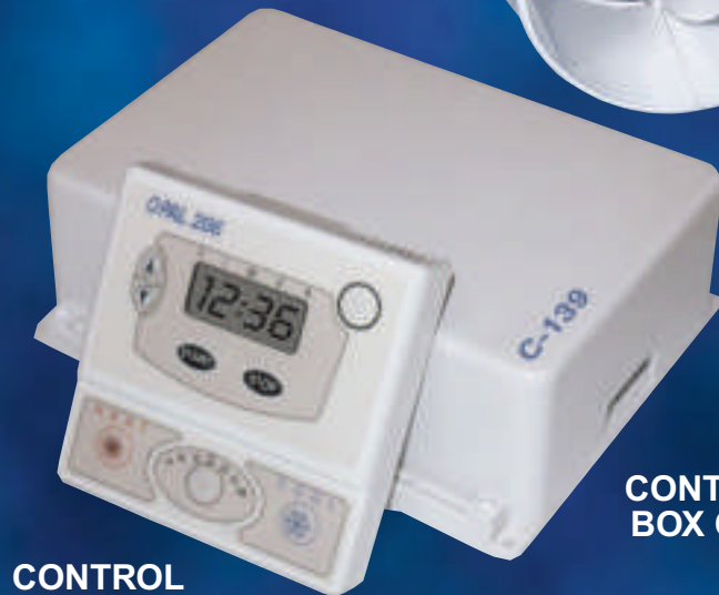
CONTROL PANEL C206